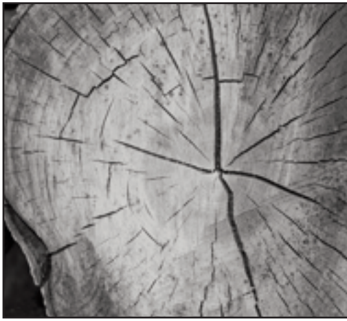
Untitled Makayla Townsend '14