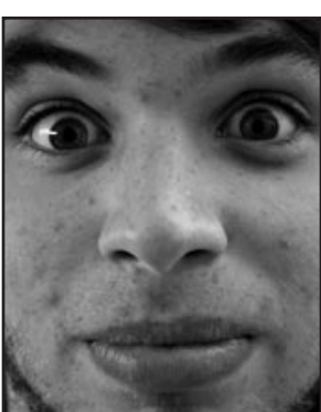
Ryan Noss '14 Photo Editor