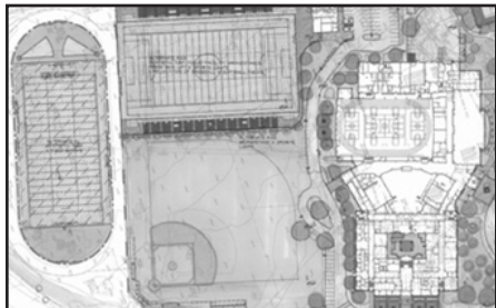
Plan of the new turf construction

Beverly High has been awarded a state grant to build a turf field. One condition of the grant is that we have 1 year to design it and 1 year to build it.