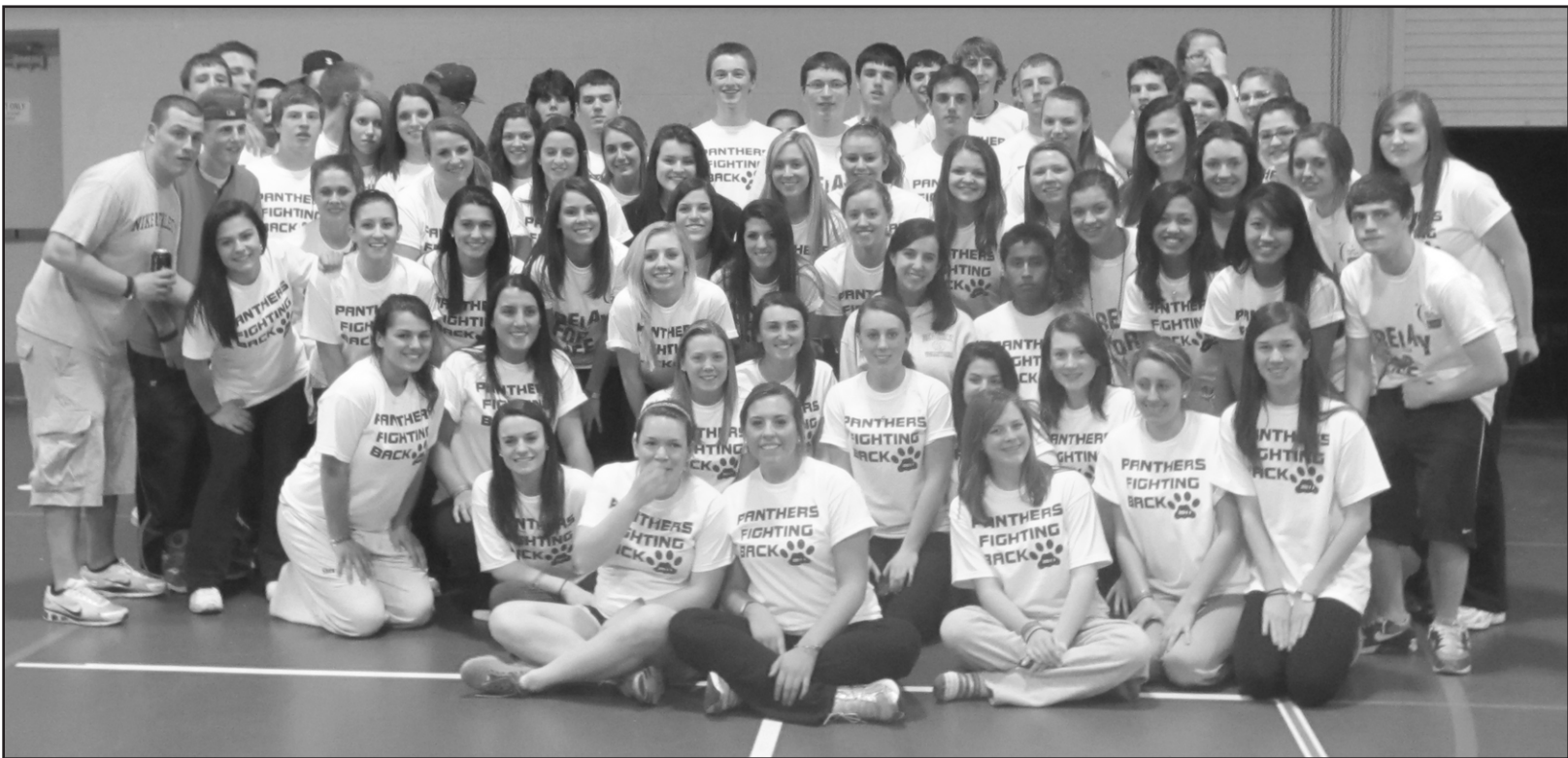
BHS Relay for Life Team

Statement of Purpose: The Ledger has been written and published by BHS students since 1979. The Ledger's aim is to explore and expose issues important to students and staff. None of the opinions expressed reflect those of Beverly Public Schools or BHS Administration. The Ledger does not discriminate on the basis of race, color, religion, national origin, sex, sexual orientation, age or disability in admission or access to its programs, services or activities, in treatment of individuals with disabilities, or in any aspect of their operations.