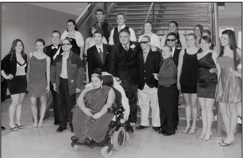
Beverly Best Buddies before the prom.

Last Friday, the Beverly High School Best Buddies attended the Best Buddies Prom at Babson College. There was a dinner, lots of dancing, and distinction awards that were given out to buddy pairs. To top off the night, Miss Massachusetts made a surprise appearance and took pictures with many of the students.