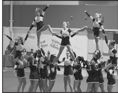
Cheerleaders perform at their competition

The BHS Varsity Football Cheerleader's successful season came to a close at their regionals competition.