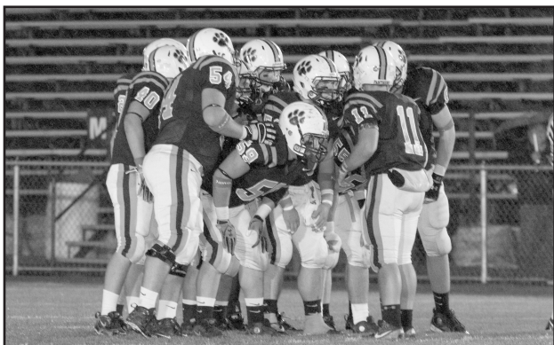
Panthers in a huddle "under the lights"

Whether it was the hunger for playoffs or the family feel of the team that drove them, the Panthers are standing at the door, and they are knocking. A team that everyone turned their backs on is now standing atop the NEC Small and is on its way to the playoffs.