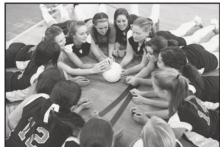
Girls prepare before their match against Stoneham.