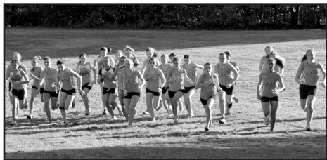
Beverly girls stay together throughout the race.