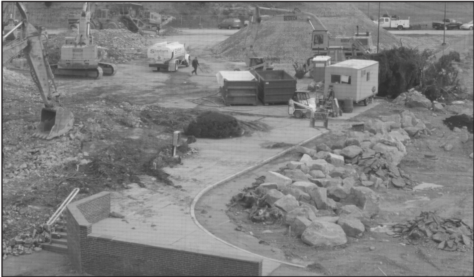
Destruction of the old high school continues.

men wearing make up and people crammed in a room, jumping up and down, singing and dancing. Sunday comes, and it is a sad day. Cast circle is filled with emotion and seniors' going away messages, filled with advice, stories, and sad good-byes. Tears do appear in the eyes of the cast, crew, and pit, but still everyone collects themselves to put on yet another amazing show. Once the show comes to an end on Sunday, instead of gathering and going out to eat, everyone says hello and thank you to their supporters. Bitter sweetness has never been so evident as the participants are so proud of the job they have just done, but sad to see their hard work and the set disappear. On stage they are in a world of their own, but once the show is finally over and the music stops, members of the play destroy the world in which they have lived for three hours a night for the past four nights.