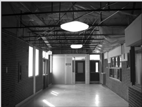
Elizabeth Olsen photograph

Construction as of March 3rd has been progressing nicely.