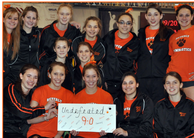
Undefeated Gymnastics Team

The Girls Gymnastics Team came a long way since last season, where they had finished the season with a 5-4 record. This season, the girls had other plans in mind. The team went undefeated throughout the regular season, earning the NEC/CAL title.